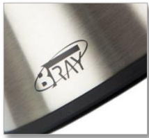
304 Stainless steel body