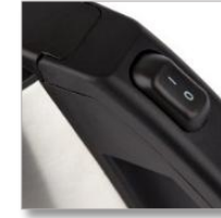
On/off button Auto shut-off